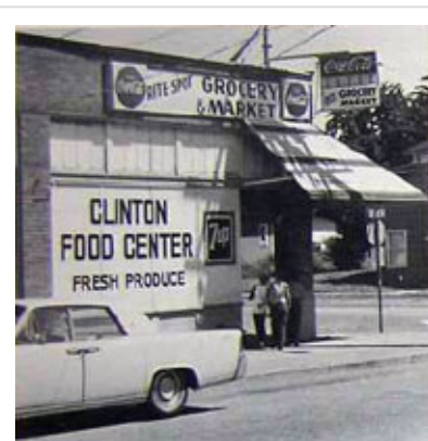
Building at SE 26th & Clinton during the 1970s.