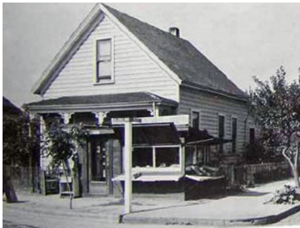
Home at SE 21st & Taggart sometime during the 1930s.