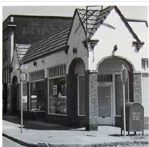
Buildings at SE 25th & Clinton during the 1970s.