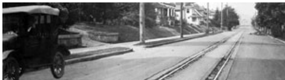
Streetcar rails along SE Clinton, taken sometime during the 1920s.